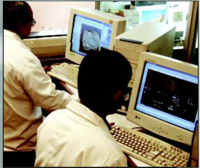
Research & Development Unit

We are constantly engaged in incorporating new find Design and Engineering solutions for the benefit of the industry. Our state-of-the-art premises at Bahadurgarh, a suburb of Delhi is a model of ecological balance and technological harmony. We cater power solutions for a wide range of automobiles including tractors and other heavy industrial engines and generators. Providing customized solutions to the requirements and quality development of products has spurred our growth. Besides, our products are economically placed with unmatched quality performance.